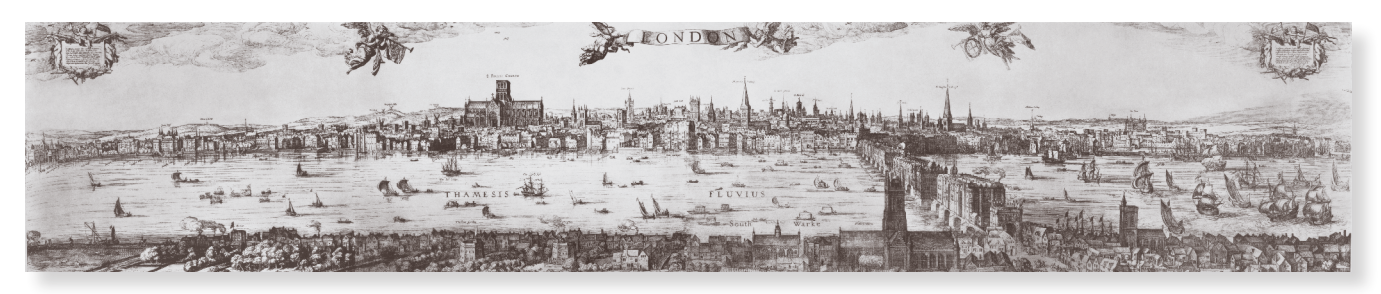
London in 1616

Compare political, economic, religious, and social reasons for the establishment of the 13 English colonies.