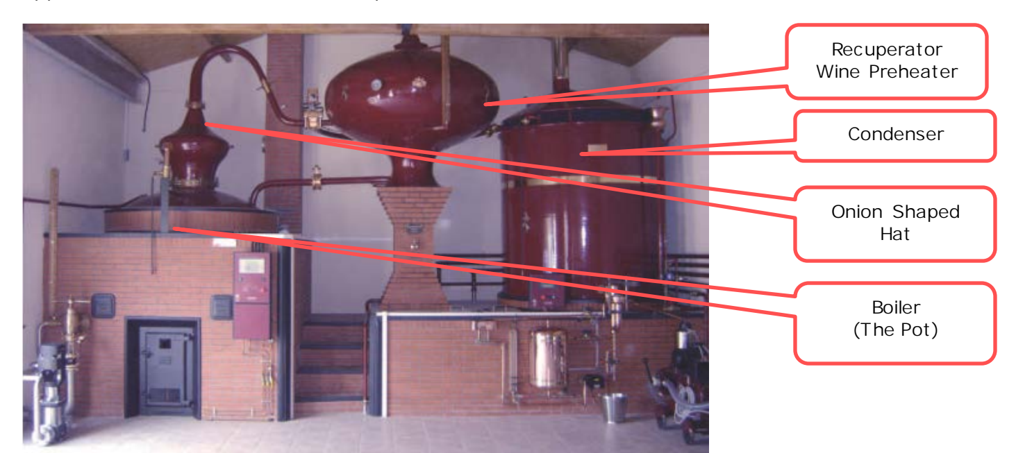
Figure 1: A Pruhlo Alambic (Pot) Still, Similar to GR's

Upon entering, one was immediately presented with a view of the large still manufactured by Chalvignac Prulho Distillation in Chateaubernard, France, see Figure 1. This figure is similar to GR's in size and coloration; GR uses painted iron supports rather than brick shown in the Figure. The GR still is propane fired. See appendix A for a schematic of the pot still.