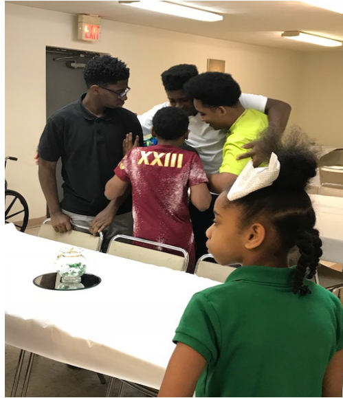
Pastor & Wife Anniversary